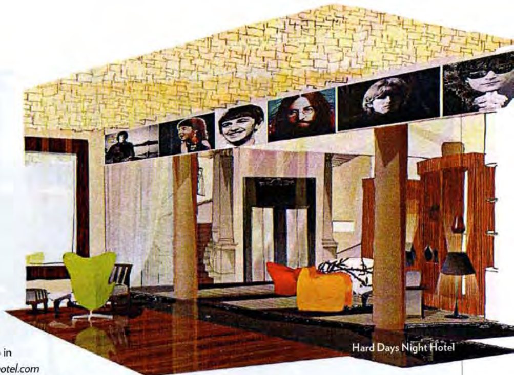
Hard Days Night Hotel

PARTY LIKE A ROCK STAR Tuck into traditional Jamaican dishes like jerk chicken at the Simmer Down restaurant, then finish off the night in the outdoor Stir It Up bar.