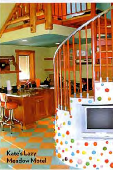
Kate's Lazy Meadow Motel